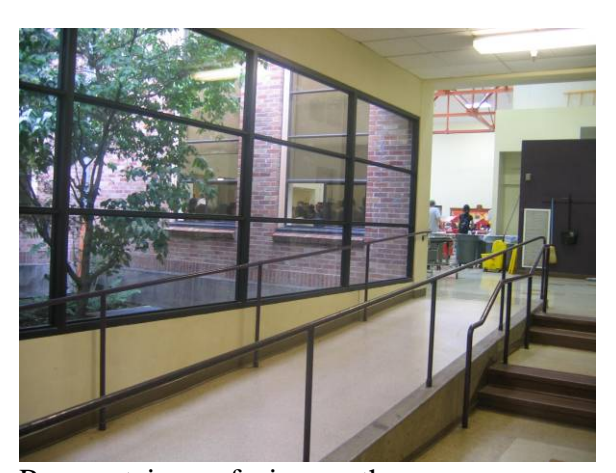
Ramp, staircase facing north