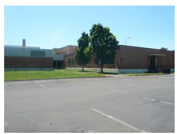
North elevation facing southeast