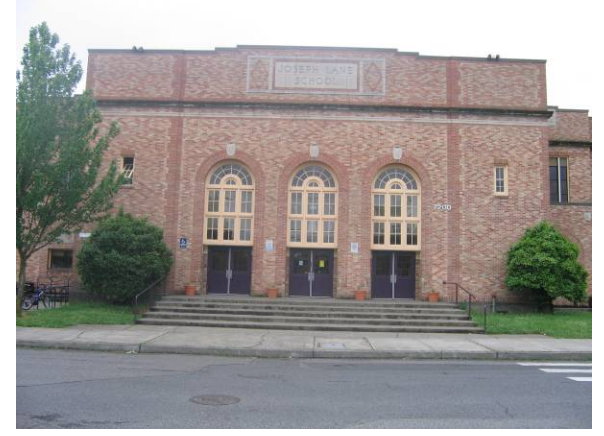
West elevation facing east