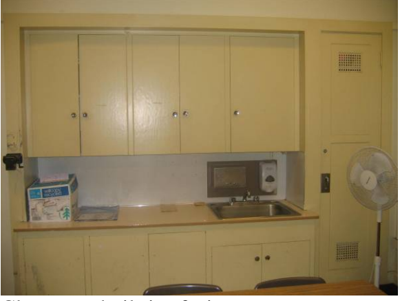
Classroom built-ins facing east