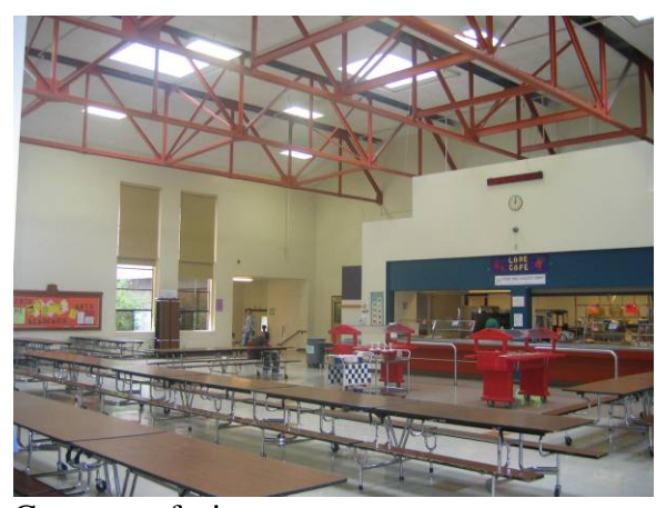
Commons facing west