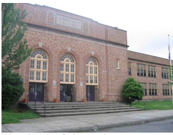
West elevation facing southeast