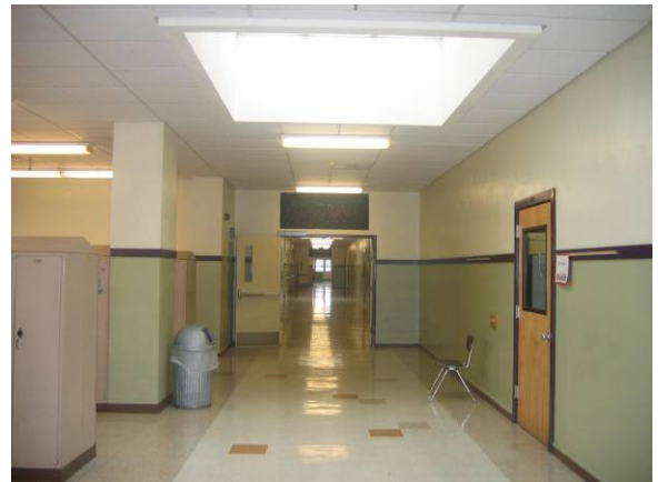
2<sup>nd</sup> floor corridor facing south