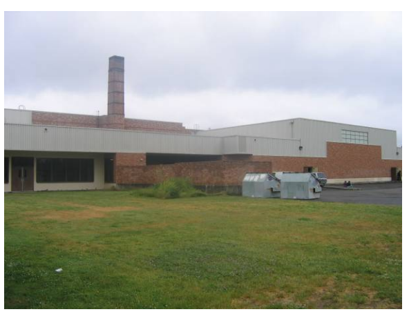
East elevation facing west